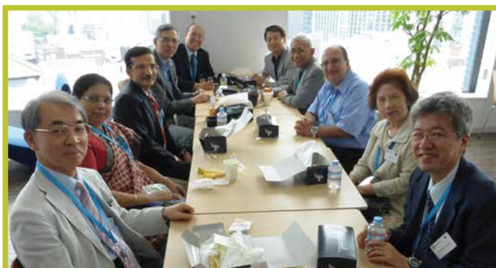
APHOG meeting in Tokyo (August, 2013)