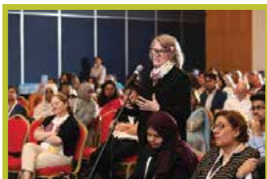
Audience at SIOP Asia