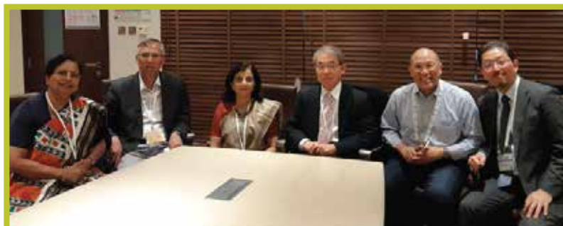
APHOG meeting in Abu Dhabi, UAE (March, 2019: SIOP Asia 2019)