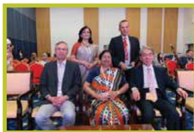
A rare photograph of 5 continental presidents of SIOP Asia