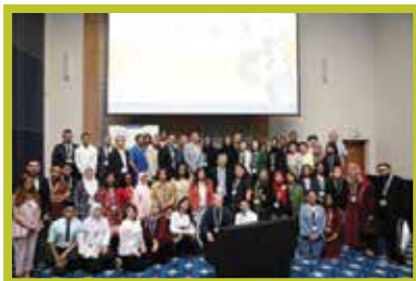
CCI group at SIOP Asia 2019