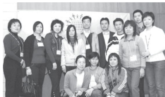
Parents from different cities of China joining the meeting

Further to the Shanghai meeting, we are glad to report that Shanghai parent support group has been officially formed in early June. Also Guangdong parents will be meeting with Hong Kong parents on 30 th June in order exchange ideas of parent support activities. The meeting on 30 th June will end up with a presentation by the parents at the 2 nd Guangdong Province Paediatric Oncology Symposium. Thanks to the effort of SIOP-Asia to arrange the interactive session between parents and medical staff from Guangdong and Hong Kong. We sincerely hope that the continuous effort of SIOP-Asia and parents in Shanghai and Guangdong will contribute to better quality of life with the children with cancer and their families.