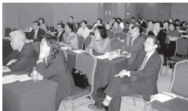
Delegates attended one of the parallel session of the congress.