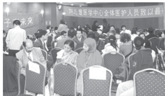
Parents from various Asia countries joined the discussion with help of interpreters.