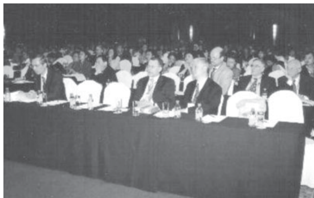
The participants listened to one of the keynote speeches. Who was giving the lecture? Of course, not the experts appeared in the front rows of this picture.

In addition to the above session for doctors, there were two parallel sessions for nurses and parents. Separate reports on these two activities are also included in this issue of newsletter.