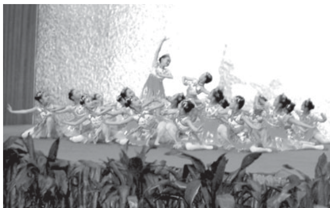
The lovely children from Shanghai gave an excellent performance during the Opening Ceremony.