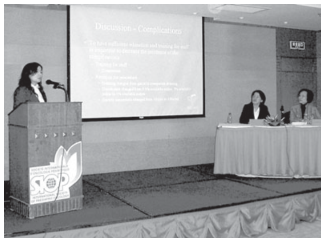
One of the presentation in the parallel nurse session during the Congress.

The nursing session of SIOP-Asia 2006 was centered on one theme, embracing what is new and controversial within the many challenging topics. The topics focused on the different research and experiences on preventing and caring the complications of chemotherapy, the advanced nursing techniques, palliative care, support for children with cancer and their families, and so on. The evidence-based presentations updated and promoted our