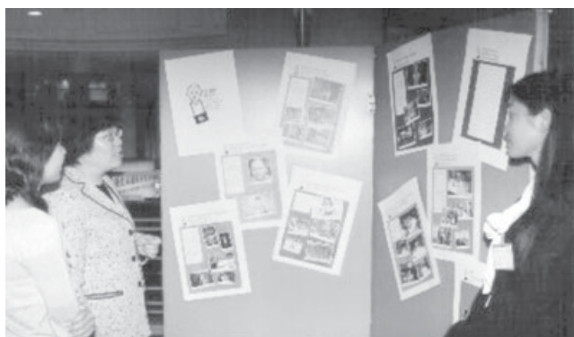
The delegates discussed with the presenter about one of the poster.

The 4 th SIOP -Asia conference was successfully held on 6-8, April 2006 in Shanghai. The theme of the conference was 'Recent Progress in Childhood Cancer'. There were about 150 delegates coming from China and 150 delegates from other countries including Asia and outside Asia. The delegates included doctors, nurses, and parents. The Conference also provided scholarship to 10 representatives that included free registration and accommodation. The venue of the Conference was Guangda Convention and Exhibition Center, and is also a 4 star hotel. It situated at the city center and was easily accessed by public transport including subway. There were also a number of 2-3 star hotels within walking distance, and charged at about US $30-40/day. Since many delegates came from resource poor countries, the low accommodation cost and easy access to the conference center facilitated more participants to join the congress.