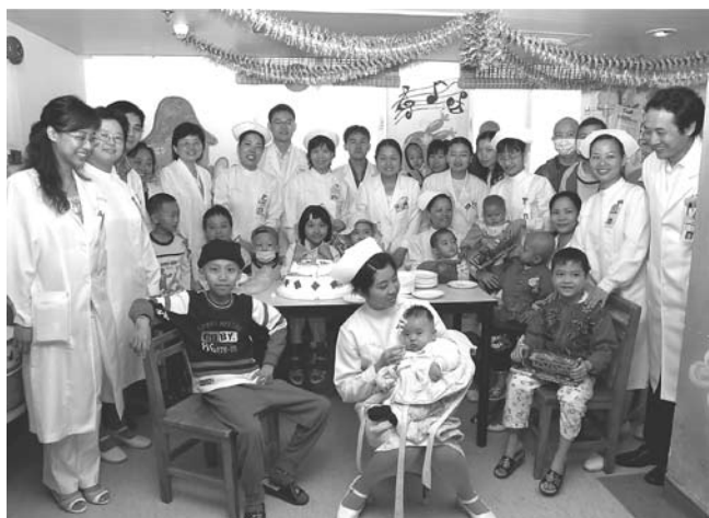
The nurses, doctors and patients joined a birthday party in the children oncology ward.

The annual number of outpatients attending the clinic is 260,000. The number of in-patients and out-patients rank first in all cancer centers in China.