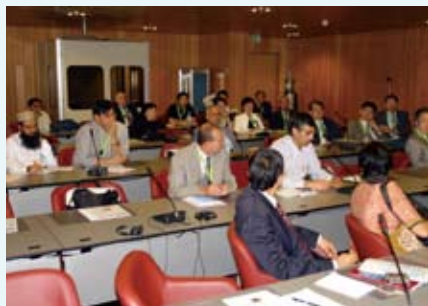
Asian SIOP members attended the annual meeting.