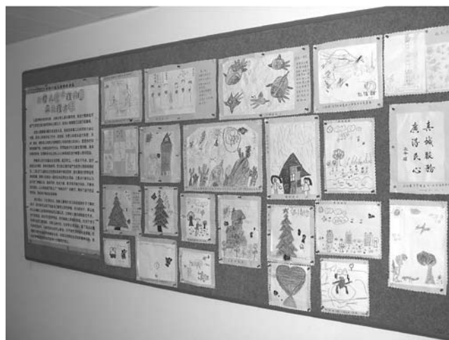
The paintings of the patients shown in the children oncology ward

children cancer centers in Hong Kong, the Chinese University of Hong Kong and the University of Hong Kong.