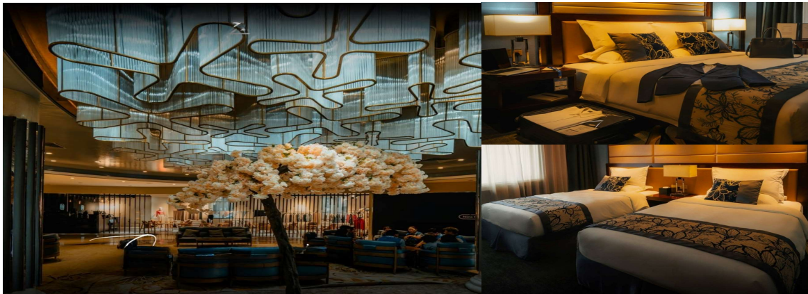
Hotels & Rates (per room, per night)

Zuchi Hotel is a centrally located hotel in Ulaanbaatar offering comfortable rooms and basic services for business and leisure travelers.